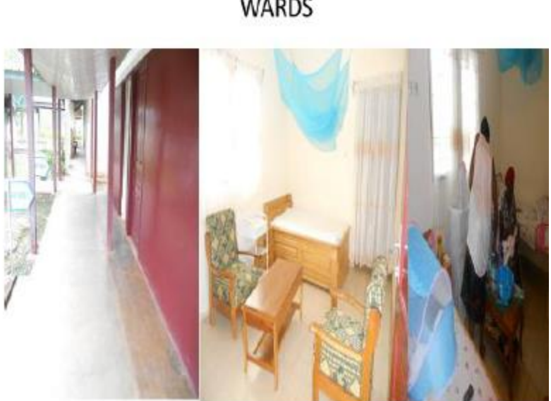
DISTRICT HOSPITAL KUMBA CREATION OF VIP WARDS

From Fig 3 it is clear that, PBF has been instrumental to the construction of the new building providing the initiative and necessary finances to achieve the results. This health facility had the capacity to provide better health care to the population but just needed innovation and finances to achieve high levels.