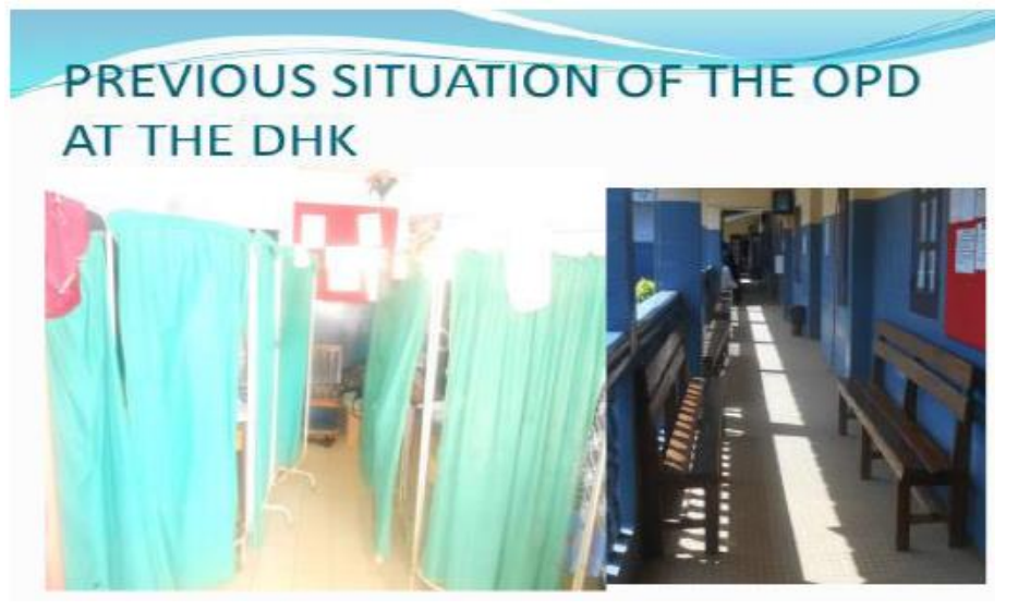
Figure 5. Previous situation of the OPD at the DHK

The Out-Patient Department (OPD) situation at the District Hospital Kumba (DHK) look like this before the implementation of PBF, which posed a problem in terms of delivery of health care and comfort of the patients.