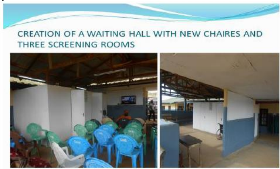
Figure 6. Current situation

The Out-Patient Department (OPD) situation at the District Hospital Kumba (DHK) look like this before the implementation of PBF, which posed a problem in terms of delivery of health care and comfort of the patients.