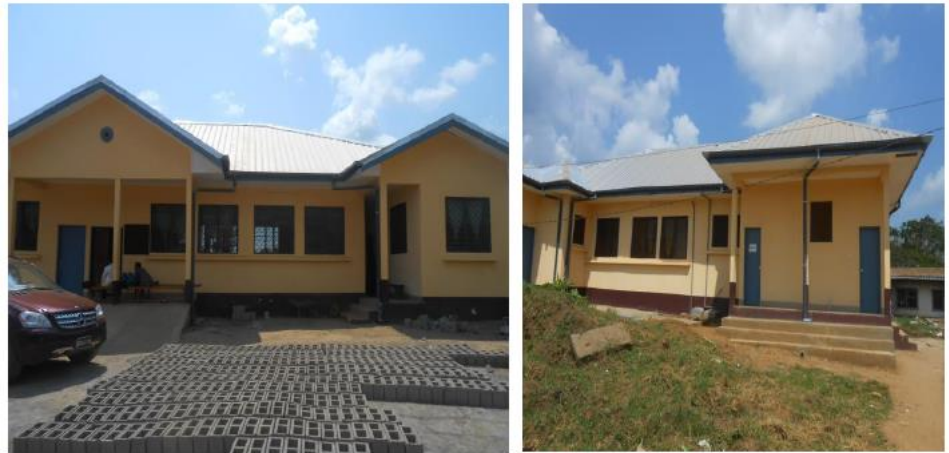
Figure. 3. CMA after construction of the wards

Due to the construction of this new building, the maternity has moved to the new site providing much space for the old building for hospitalization and other activities.